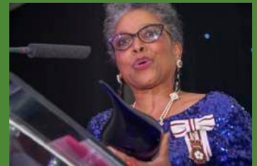
2018-Peaches Golding OBE, Lord Lieutenant