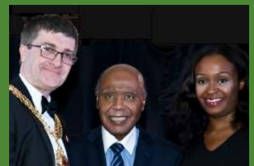
2016-Paul Stephenson OBE